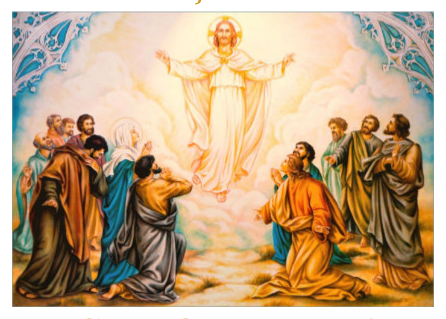
The Cross Country Parishes of Acton with Worleston, Church Minshull and Wettenhall